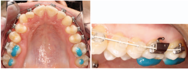
Figure 1. Occlusal and lateral views of resin build-ups.

described a technique consisting of rapid molar intrusion (RMI), obtaining significant skeletal changes in nongrowing patients.